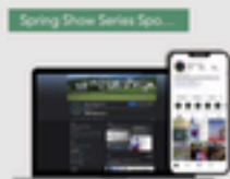
Social Media Presence (Friend or Partner Feature) $150.00