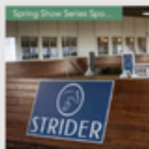
Banner on the Wall $350.00