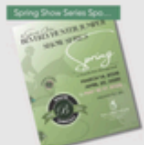
Ad in the Program - Full Page $200.00