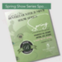
Ad in the Program - Half Page $150.00