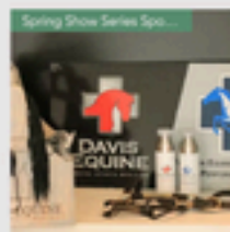
Presence on the Prize Table (2 Options) $250.00